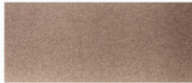
No Popping Residues (strip temperature below resist bake temperature)