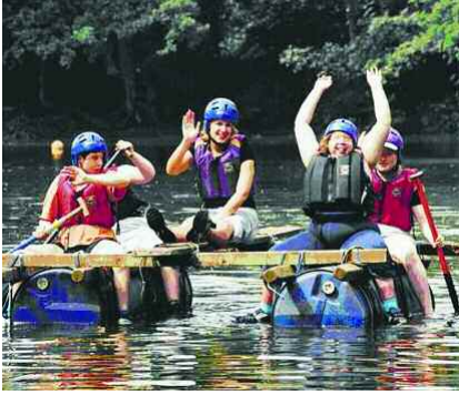
In 2005, Legal & General supported the Royal National Institute for the Blind (RNIB) Vacation Schemes.