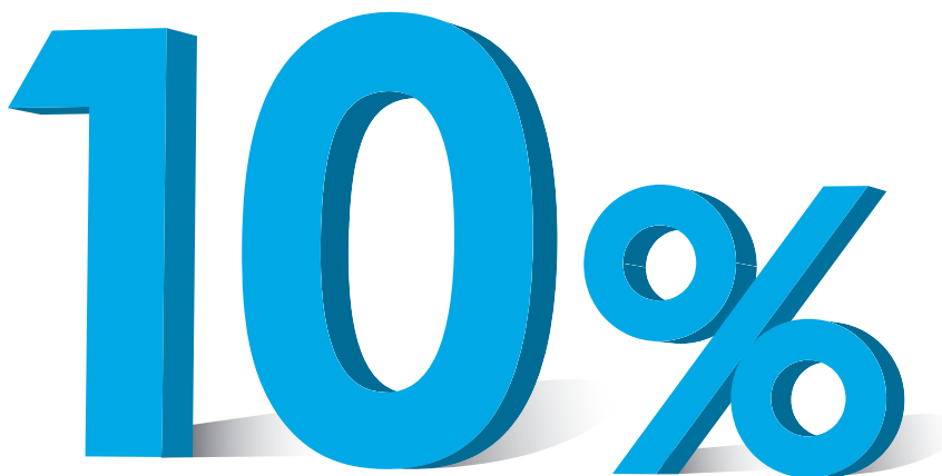
10% OF STAFF DONATE TO CHARITY VIA GIVE AS YOU EARN

Community Awards – New Development It's a high priority for us to recognise and reward staff members who devote time to helping their community or a favourite charity. In an exciting new development, this year we will be combining our Community Awards with our environmental 'Making a Difference' (MAD) Awards that were launched in 2005 (see 'Our Environment'). Instead of an annual two-week process, nominations can be received for a MAD Award at any time during the year, and a combined awards ceremony will be held at the end of the year to celebrate the achievements of our staff.