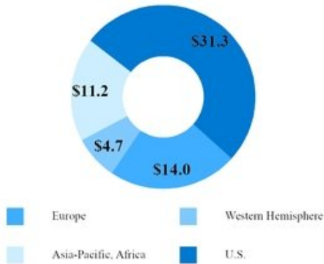
Nine Months 2018 Sales by Geographic Region (in billions)