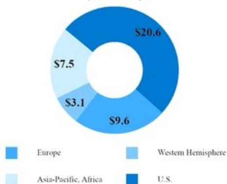
Six Months 2018 Sales by Geographic Region (in billions)