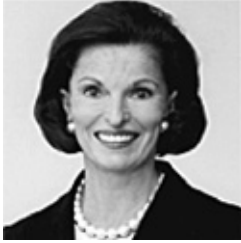
Ann McLaughlin Korologos