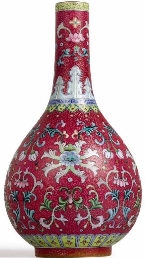
An exceptionally fine and rare ruby-ground Yangcai vase Seal Mark and Period of Qianlong. Est: HK$40 million–60 million