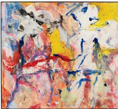
Willem de Kooning, Untitled , 1977, oil on canvas, 137.1 x 152.4cm

This exhibition showcases two best-known series of Spanish artist José-María Cano: ‘WS100’ and ‘The Soul of Money.’ Creating leading figures from the financial sector in the striking style of the Wall Street Journal and portraying the texture of important currencies in large-format, extremely detailed presentations, Cano conveys his thoughts on capitalism and its impact on human civilisation. More details here .