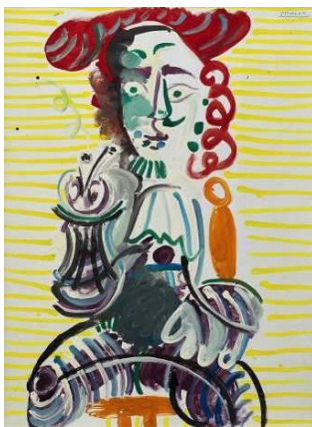
(Left) Pablo Picasso, L'homme à la pipe ( Man with a Pipe ), 1968, oil on canvas, 130 x 97 cm © 2018 Estate of Pablo Picasso Artists Rights Society (ARS), New York (Right) George Condo, Princess , 2008, oil on canvas, 101.5 x 92 cm © George Condo Artists Rights Society (ARS), New York