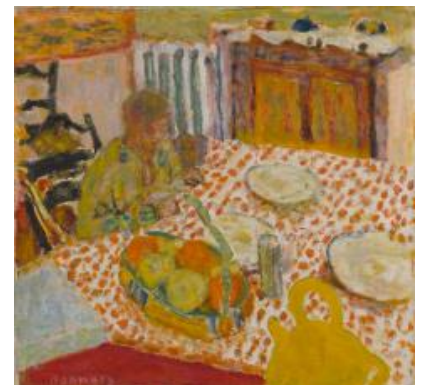
Pierre Bonnard, Marthe et son chien assise devant une table , circa 1930. © 2018 Estate of Pierre Bonnard/ Artists Rights Society (ARS), New York, NY Sotheby's, Inc. License No. 1216058. © Sotheby's, Inc. 2018