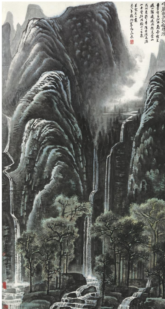
Li Keran, Magnificent Mountains with Gushy Cascades , 1978, ink and colour on paper, hanging scroll, 171 x 94 cm, Estimate Upon Request

- To Commemorate the 110th anniversary of the Artist's Birth -