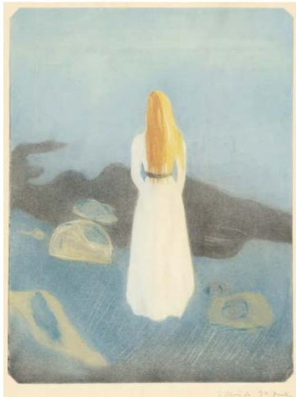
Edvard Munch Young Woman on the Beach. The Lonely One (SCH. 42; W. 49) Estimate $3/4 million