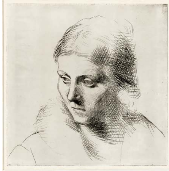
Pablo Picasso Portrait d'Olga au Col de Fournure (BA. 109) Estimate $800/1,200,000

© 2017 ESTATE OF PABLO PICASSO / ARTISTS RIGHTS SOCIETY (ARS), NEW YORK