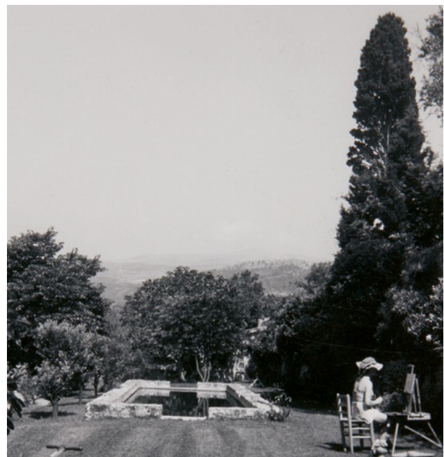
Vivien Leigh painting at an easel in the garden.