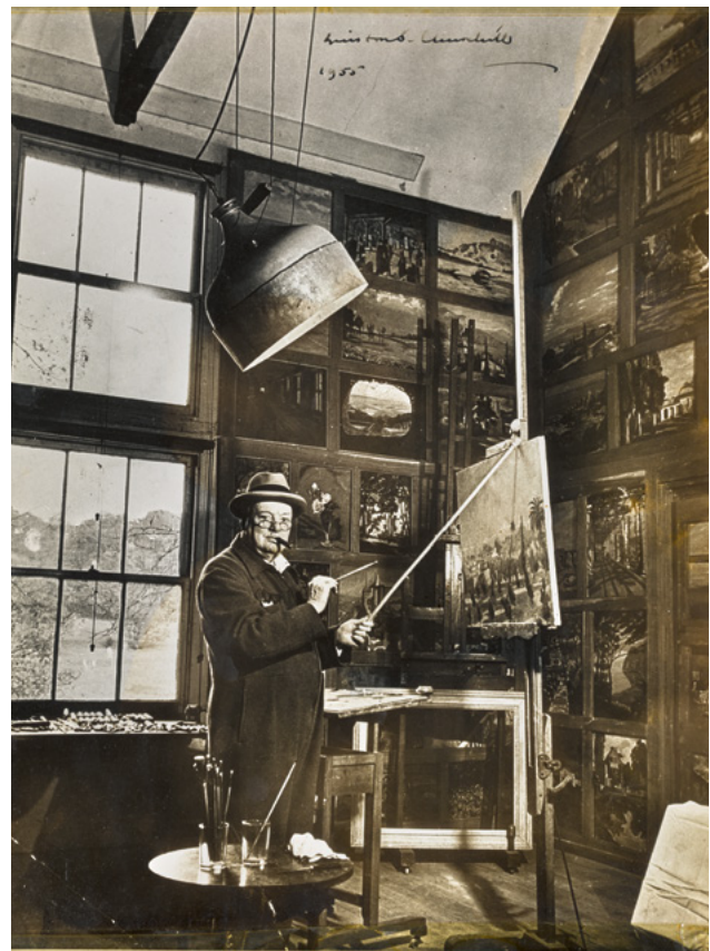
Winston Churchill in his studio at Chartwell. Roses in a Glass Vase can be seen hanging on the wall beside him.

“Whenever I feel particularly low or depressed I look at those three rosebuds. The thought and the friendship in the painting is such a great encouragement to me... and I have the determination to go on.”