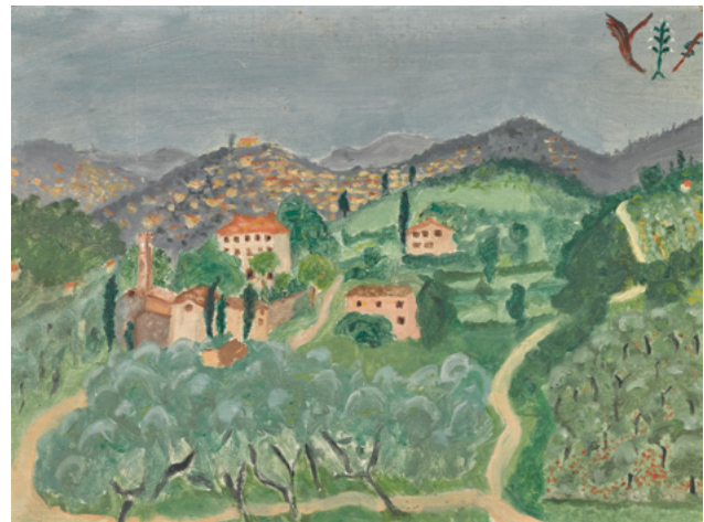
VIVIEN LEIGH. Italian Landscape . Estimate £200–300

However, Churchill and 'Painting as a Pastime' clearly inspired Vivien to paint as demonstrated by one of her own works, a delightful Italian landscape (est. £200–300) included in the sale, alongside her canvas artist's bag containing a wooden box with oil paints and a travelling folding easel (est. £800–1,200).