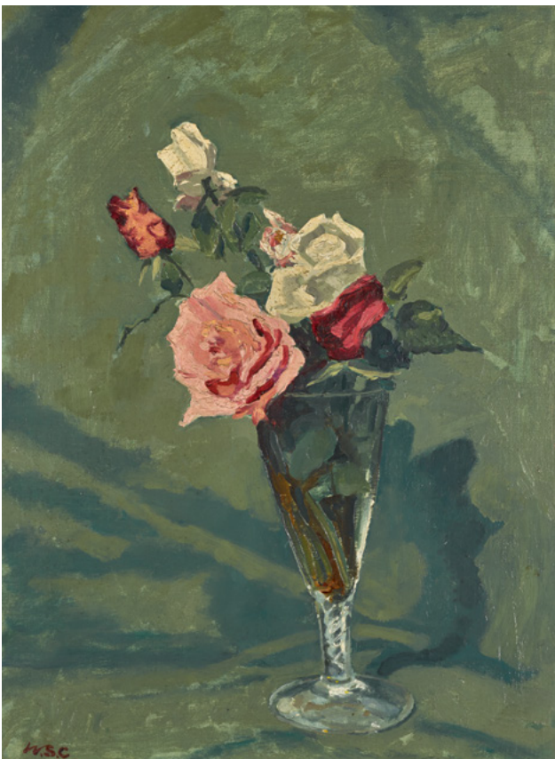
SIR WINSTON CHURCHILL, Roses in a Glass Vase , Estimate £70,000–100,000

Revealing the little-known story of the friendship between the Prime Minister and legendary star of Gone with the Wind