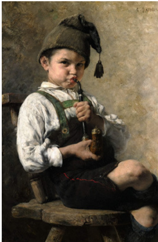
Georgios Jakobides, Grandpa's New Pipe , oil on canvas, estimate: £200,000-300,000

AN UNPRECEDENTED TEN WORKS BY CONSTANTINOS VOLANAKIS AND SEVEN BY GEORGIOS JAKOBIDES WILL REPRESENT THE MOST IMPORTANT GROUPS OF PAINTINGS BY THESE ARTISTS EVER TO APPEAR AT AUCTION