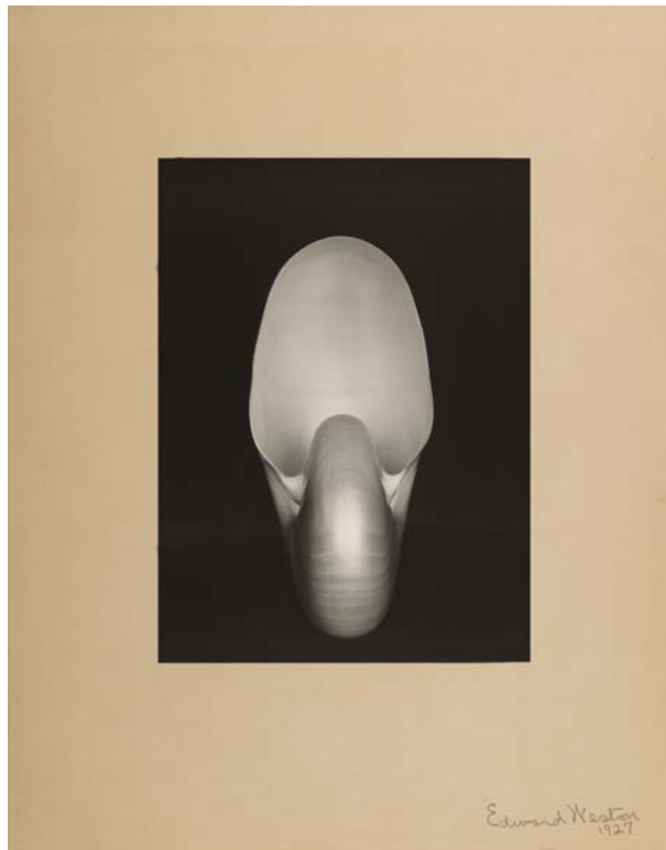
Pictured above: Edward Weston, Nautilus , est. $600/900,000

New York, New York – Sotheby's October 15 th -16 th sale of Photographs comprises the strongest group of photographs from various owners to be presented at auction in recent years. The sale includes an unusually fresh and wide-ranging selection of images from all decades, from a rare daguerreotype of 19 th -century Baltimore to contemporary works by Robert Adams, Peter Beard, and Hiroshi Sugimoto. Of special note is an exemplary group of blue-chip American photographs from the first half of the 20 th -century, including ones by Edward Weston, Imogen Cunningham, Dorothea Lange, Paul Strand, and Walker Evans, all premier examples of the artists' works, and many with outstanding provenance. The sale is expected to bring $6.7/9.9 million*. A press