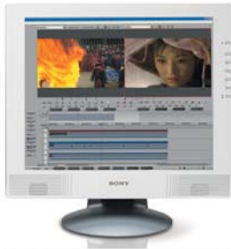
Avid | DS HD system

For nearly 15 years, Avid has focused on one thing — helping professionals work more efficiently to create the most widely recognized media in the world. What started with the simple idea of using a computer to edit and enhance media in a world of tape has helped spawn a completely new world, where tape doesn't need to exist at all. As more and more professionals find themselves working in a digital world — acquiring, editing, storing, managing, and distributing media entirely digitally — Avid has responded by delivering the broadest range of professional-quality digital nonlinear media production solutions designed to streamline efficiency, increase productivity, and offer a valuable return on investment.