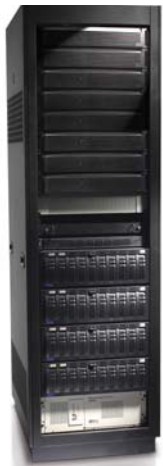
Avid Unity™ MediaNetwork

With industry leading 3-D animation, special effects, and compositing software, Softimage offers customers the opportunity to achieve significant time- and cost-savings without having to sacrifice creative freedom and flexibility.