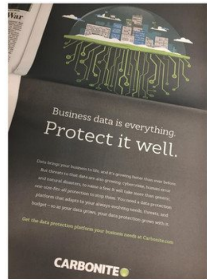
The Wall Street Journal

Learn how Carbonite helps protect personal and business data from virtually any data loss scenario imaginable.