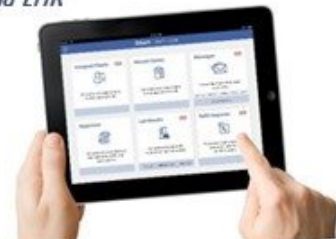
MTBC's iPad EHR