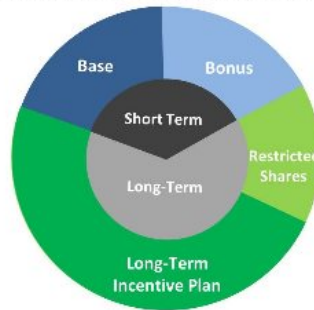
2016 NEO Total Direct Compensation