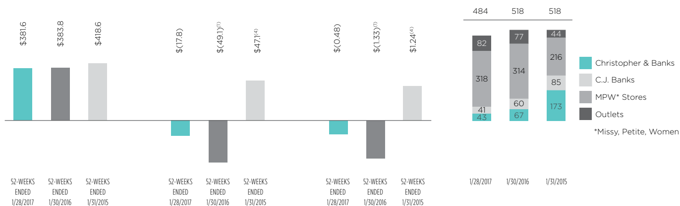
NUMBER OF STORES BY FORMAT