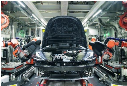
Model 3 Final Vehicle Assembly (Video Embedded)

robotic programming, and we are confident that throughput will increase substantially in upcoming weeks and ultimately be capable of production rates significantly greater than the original specification.