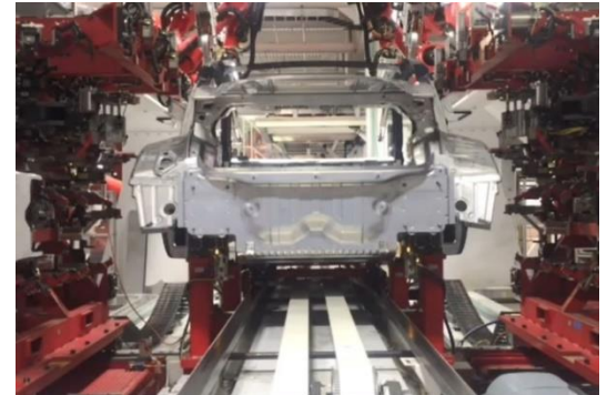
Model 3 Body Shop Welding (Video Embedded)

Several manufacturing lines, such as drive unit, seat assembly, paint shop and stamping, have demonstrated a manufacturing ability in excess of 1,000 units per week during burst builds of short duration. Other lines, such as battery pack assembly, body shop welding and final vehicle assembly, have demonstrated burst builds of about 500 units per week and are ramping up quickly. Likewise, cell production at Gigafactory 1 continues to ramp, and current cell production makes it one of the largest battery cell manufacturing facilities in the world.