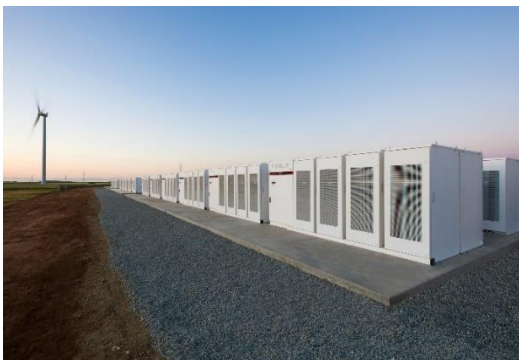
South Australia Energy Storage Project

Deployment of the 100 MW / 129 MWh energy storage project for South Australia is underway, and we are well on track to meet our 100-day deadline. Energy storage enables a more efficient, cost-effective and sustainable way to build and manage utility grid scale applications, and we expect this project to lay the groundwork for many similar projects, but at an even larger scale, in the years ahead.