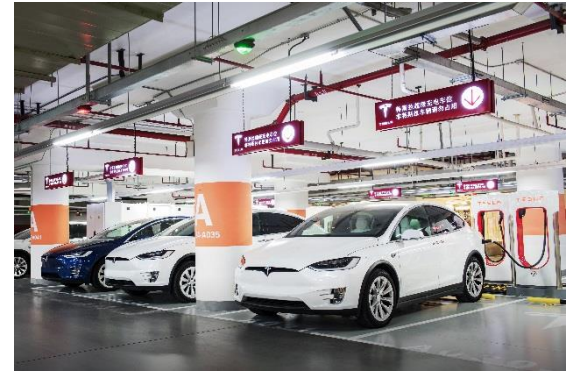
50-Stall Supercharger Station in Shanghai

We also deployed 109 MW of energy generation systems in Q3. The lower deployments are in large part a result of deliberately deemphasizing commercial and industrial solar energy projects with low profit and limited cash generation. Approximately 46% of the residential solar energy systems deployed in Q3 were sold, rather than leased, up from 13% in Q3 2016, a continuing trend that drives revenue growth and improves cash generation. We are expecting cash sales to surpass 50% of residential solar revenue in Q4. Solar Roof installations will initially ramp slowly in Q4 as we move the production process from Fremont to Gigafactory 2 in Buffalo. As we fine tune and standardize the production and installation process, we expect to ramp Solar Roof production considerably in 2018.