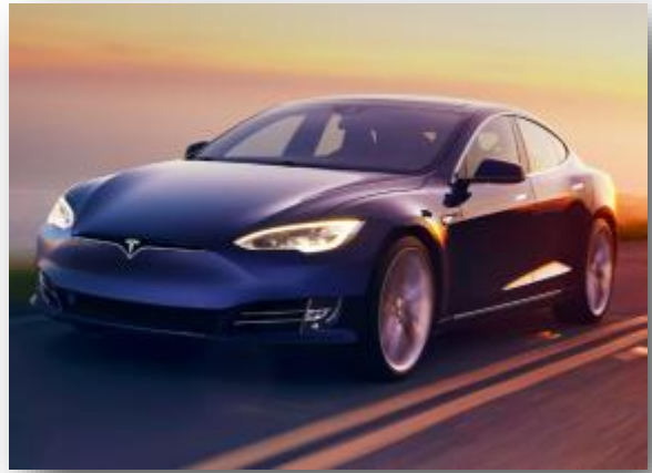
Model S P100DL The World's Quickest Production Car

Despite still ramping production, Model X is also gaining market share, already growing to 6% of the U.S. large luxury SUV market in Q3, or #8 in the large luxury SUV category, edging out the Porsche Macan and Cayenne, the Land Rover R-R Sport and the Infiniti QX80. The large luxury SUV category is three times the size of the large luxury sedan category in the U.S., and represents a huge opportunity to further increase Model X sales.