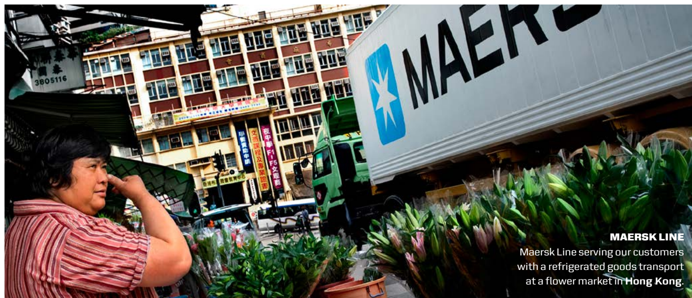
MAERSK LINE Maersk Line serving our customers with a refrigerated goods transport at a flower market in Hong Kong.

The cost initiatives announced in Q4 2015 are progressing as planned, including efforts to further reduce cost from transactional work through standardisation, automation and digitalisation of processes. Maersk Line is on track to deliver the benefits by the end of 2017.