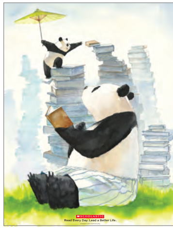
Jon J Muth